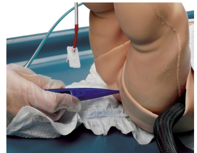
Simulated rectal temperature